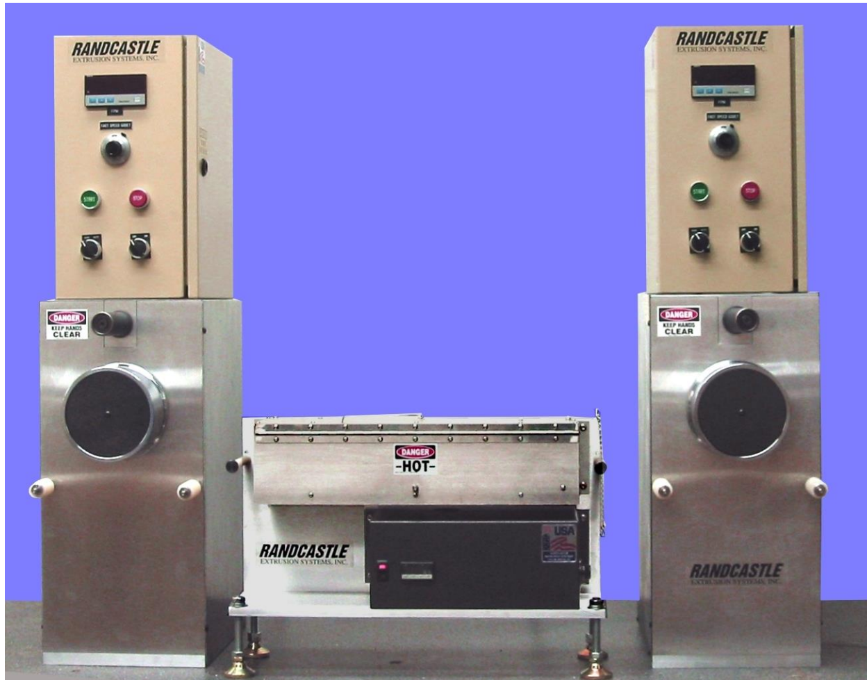
Two godets, 24 inch oven and manual control panels placed on godets