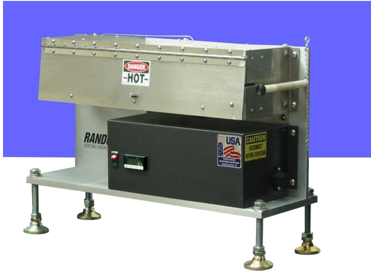
24 Inch Long Oven With Digital Temperature Control